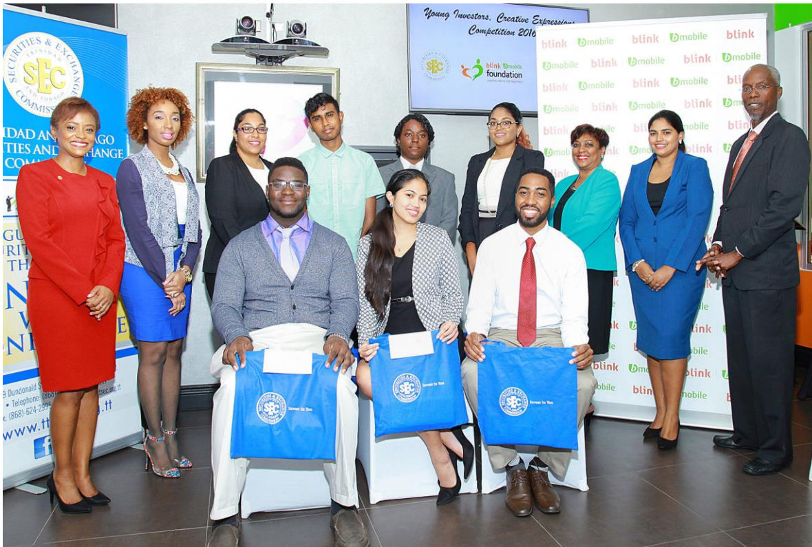
TTSEC Team & winners