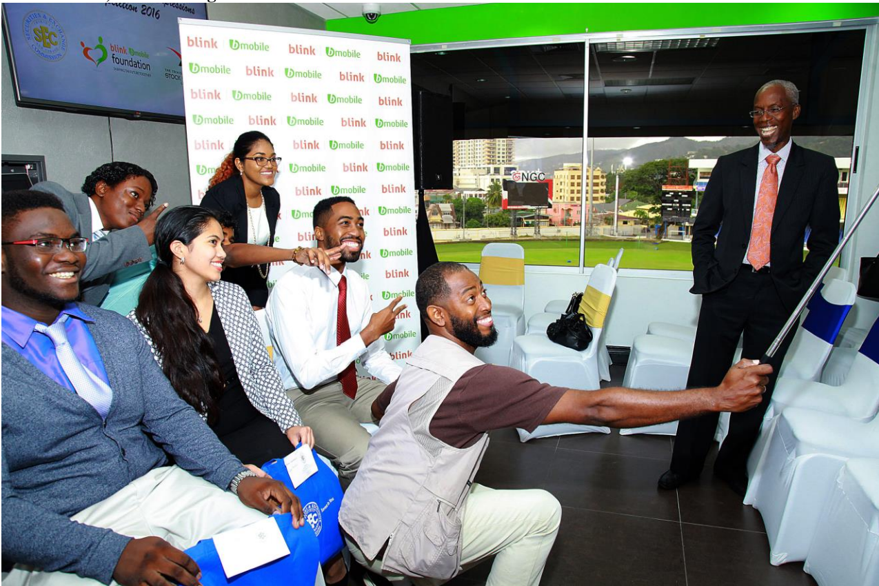
Group photo of happy winners taking a selfie