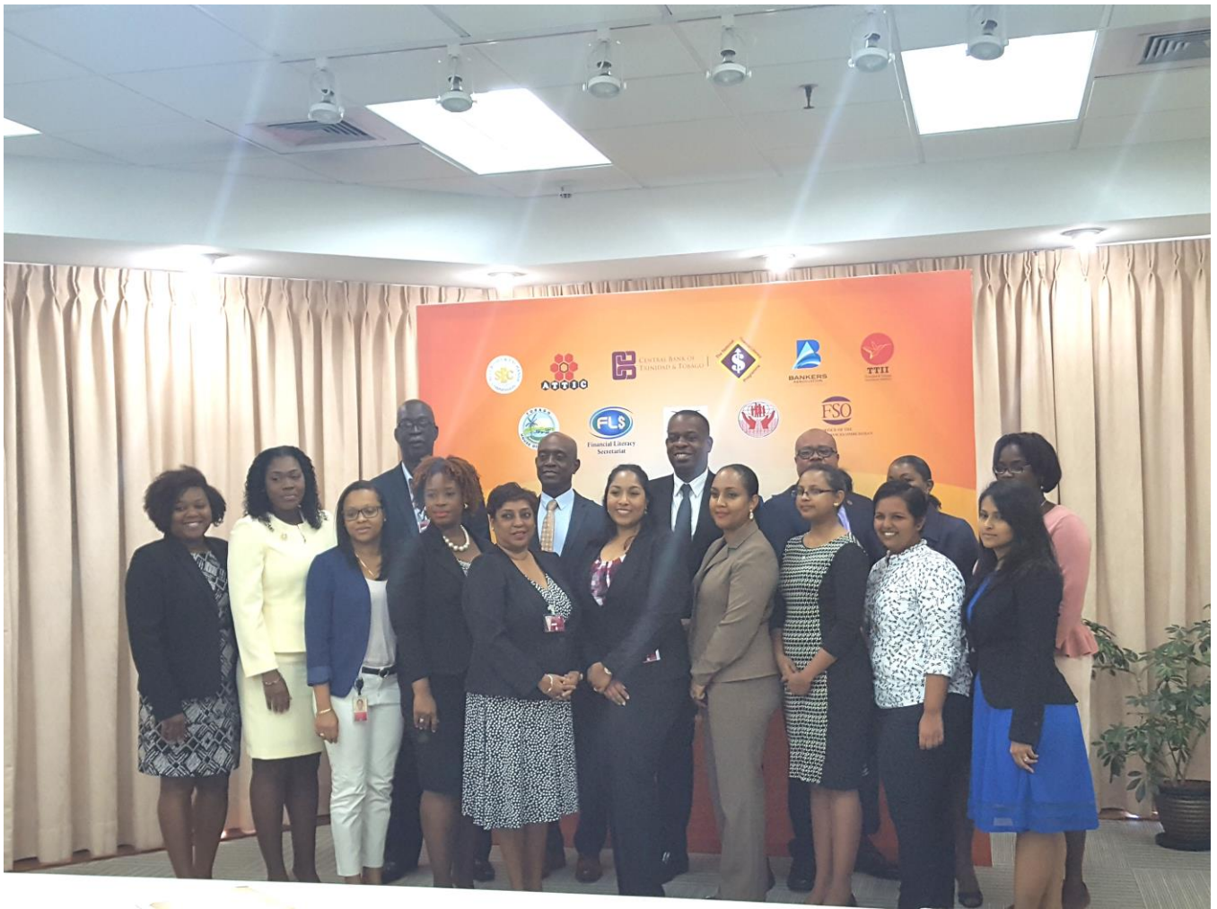
Members of the National Financial Education Committee

The TTSEC invites you to visit our Facebook Page for more information and updates regarding this event .