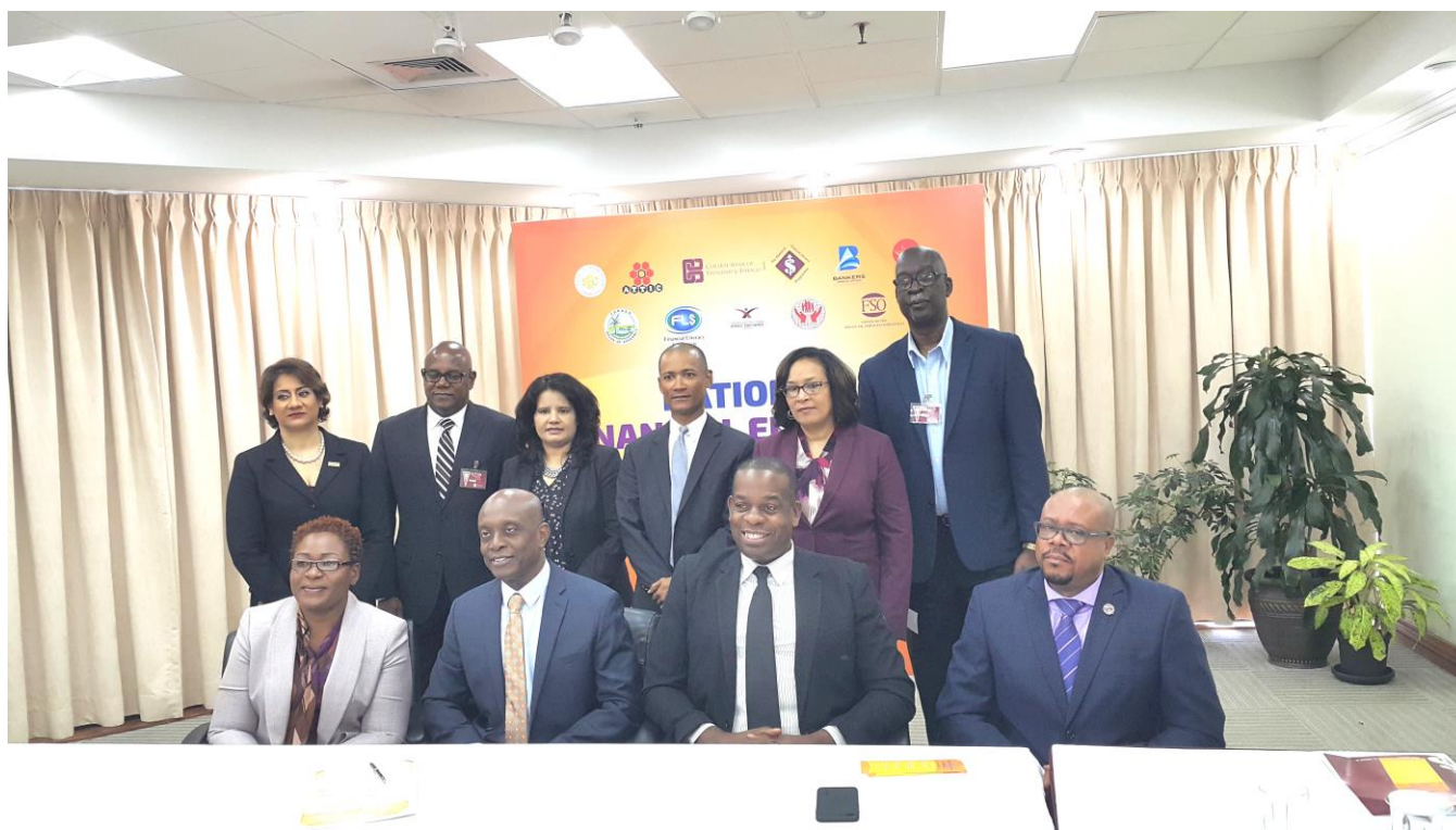
MOU Signing with Strategic Partners

On March 12, 2018, the Trinidad and Tobago Securities and Exchange Commission (TTSEC) signed a Memorandum of Understanding (MOU) formalizing its membership and commitment to the National Financial Education Committee (Committee). The MOU was signed between the Office of the Financial Services Ombudsman/ National Financial Literacy Programme (OFSO/NFLP), and the stakeholders of the National Financial Education Committee (Committee), of which the TTSEC is a member. This Committee is established to develop a national strategy for financial education across Trinidad and Tobago.