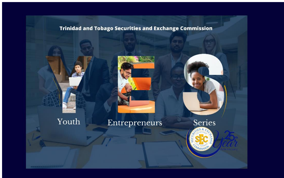
Yes Campaign image

Trinidad and Tobago nationals were invited to participate in the YES campaign by completing the simple application process that was made accessible via an online platform. The entries received were reviewed and assessed along certain criteria, one of which was the uniqueness of the venture. The successful applicants will be featured on all the TTSEC's digital platforms. The shortlisted businesses, in phase one of the campaign, are: