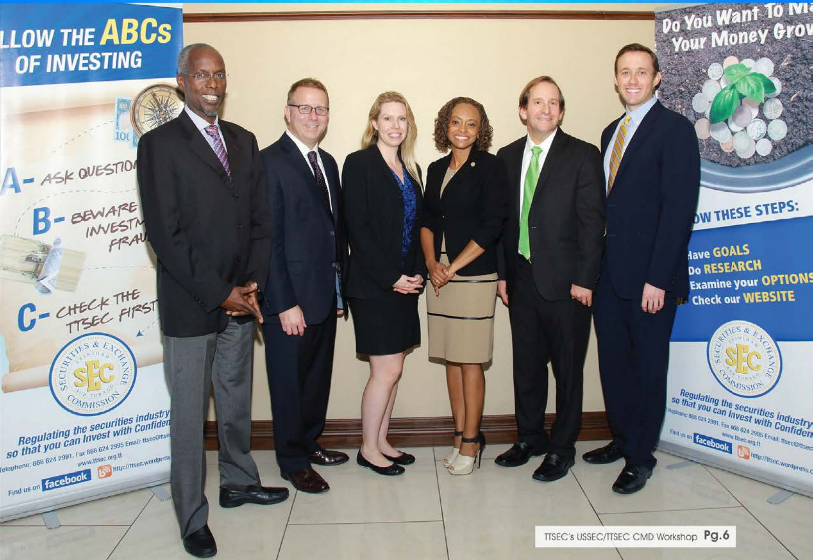
TTSEC's USSEC/TTSEC CMD Workshop Pg.6

YOU INVEST. WE PROTECT. EVERYONE BENEFITS!